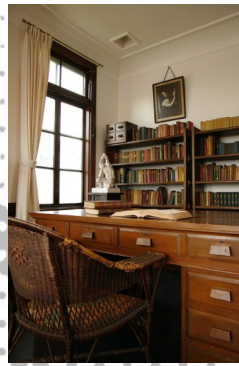
Professor Nishida's study

Kahoku city is the birthplace of world-renowned philosopher Nishida Kitaro, famous for his “ Study of Good ”. While the “Ishikawa NISHIDA KITARO Museum of Philosophy” not only introduces Professor Nishida’s accomplishments and articles of his work, here you can easily learn about philosophy and “experience reflective thinking” while having fun, as this is a “Spiritual Oasis”.