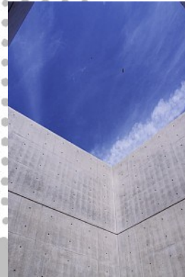
Space of Emptiness