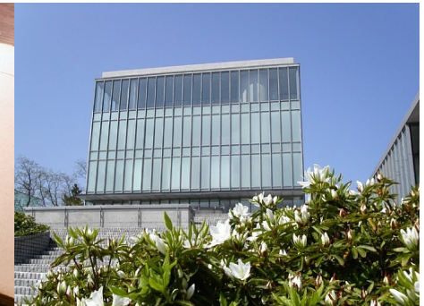
Ishikawa NISHIDA KITARO Museum of Philosophy