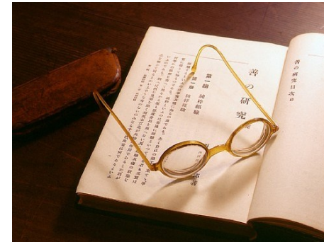
Nishida's publication “Study of Good” and his reading glasses